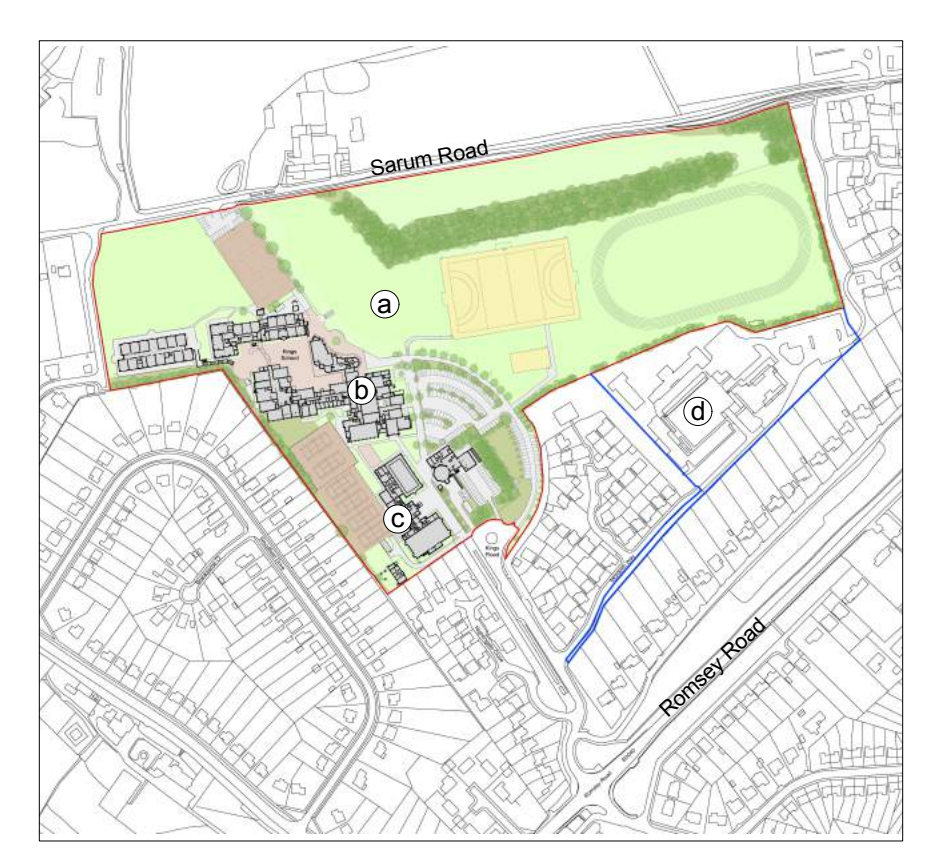
Existing Site Location Plan