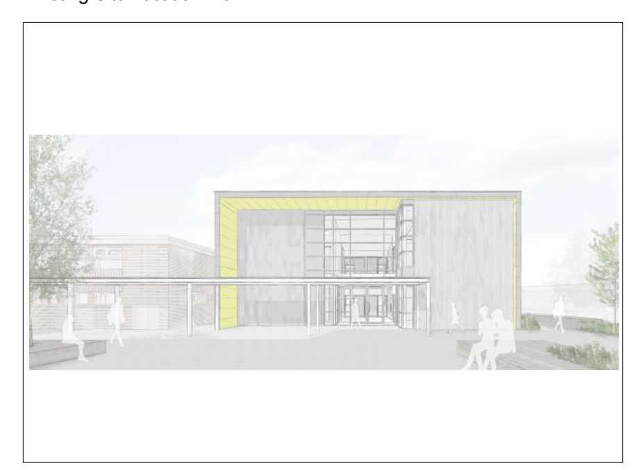
Perspective view from new courtyard of Proposed New Building Entrance